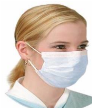
Masks are kept with the club's medical supplies.